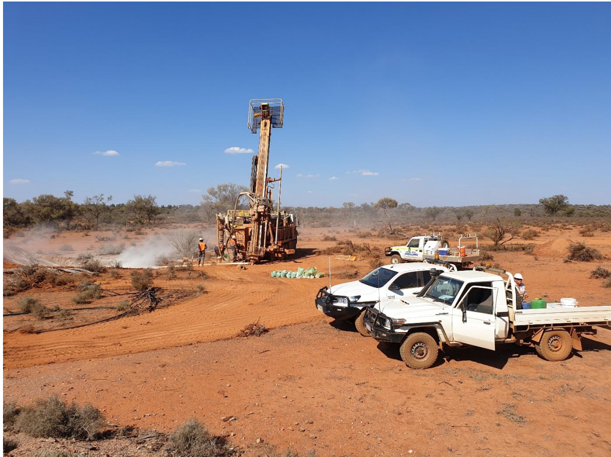
FIGURE 1: RC DRILL CREW ON SITE AT WHITEHEADS.

Having acquired an exploration option over the project with Zebina Minerals at the end of August the Company has moved quickly to commence exploration. The initial program will consist of approximately 2,000m of RC drilling on advanced prospects at Seven Leaders, Lady Betty and Whiteheads Find.